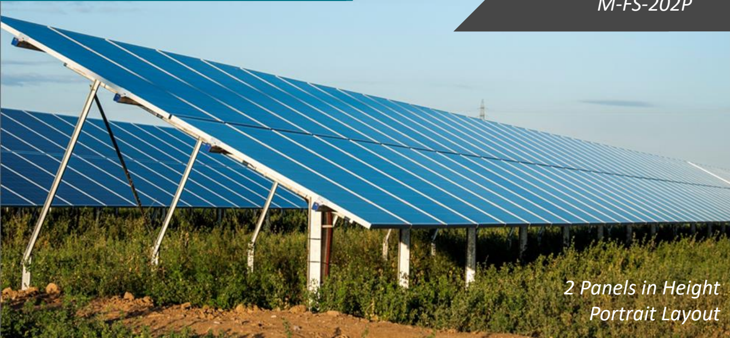
2 Panels in Height Portrait Layout