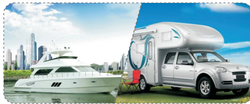
Marine & RV