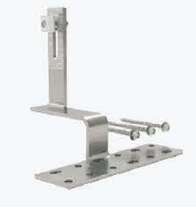
Tile Hook 09