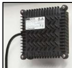
Built-In Micro Inverter