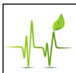
Safest PV Product on the Market

The AC Module System developed by Solar Panels Plus is a perfect solution to rising power costs, without the complications or expense of traditional PV systems.