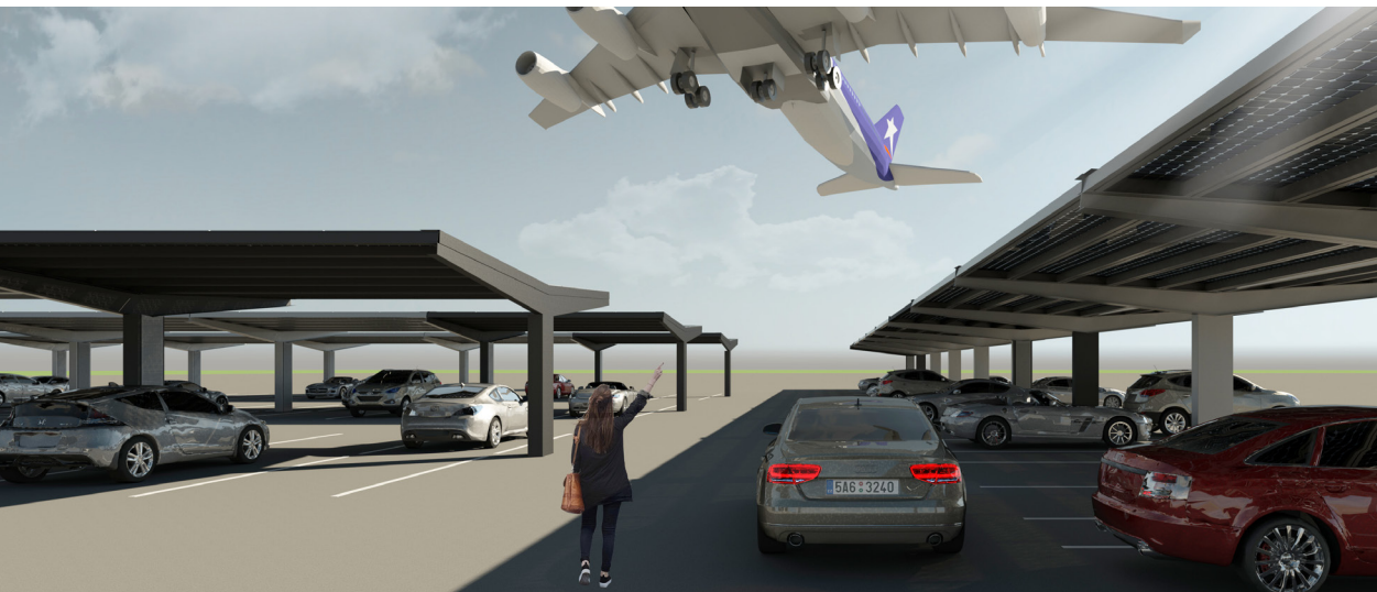
Carport OPTI-2 - 10 degrees inclination