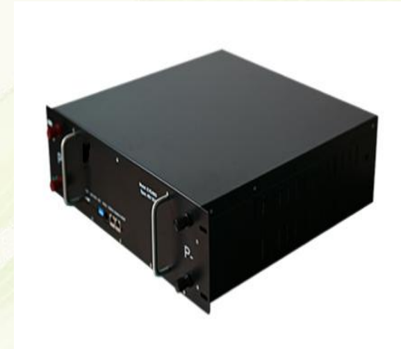
48V50AH standard module