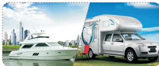
Marine & RV