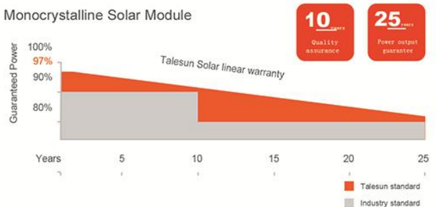
Monocrystalline Solar Module

DEZHOU RUNZE NEW ENERGY TECHNOLOGY CO.,LTD that defects will not appear in materials and workmanship defined by IEC61215, IEC61730 or UL1703 under normal installation, use and maintenance as specified in RUNZE installation manual for 10 years from the warranty starting date.