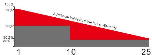
Industry-Leading Warranty Based on Nominal Power