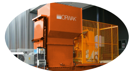
OPTION: BIN LIFTER

We reserve the right to make changes to specifications without prior notice. Bale weights are dependent upon material type.