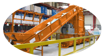
OPTION: CONVEYOR BELT