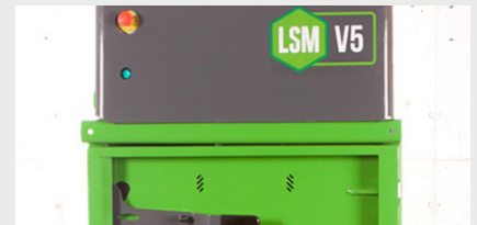
28-second cycle time