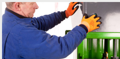
Low-voltage user controls for added safety