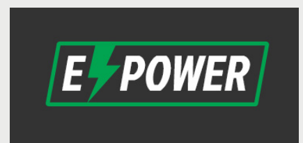
LSM e-Power for added time, energy and cost savings