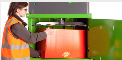
High compaction ratio and large fill chamber