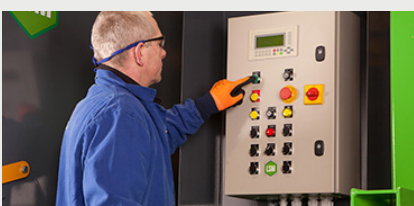
Automatic cycle with anti-jam programme