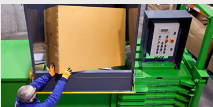
Heavy-duty V-shaped shear bar for cutting difficult materials