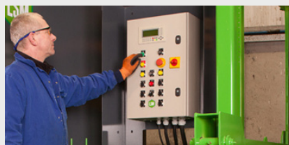
Semiautomatic guillotine-style discharge allows for full ejection of bale