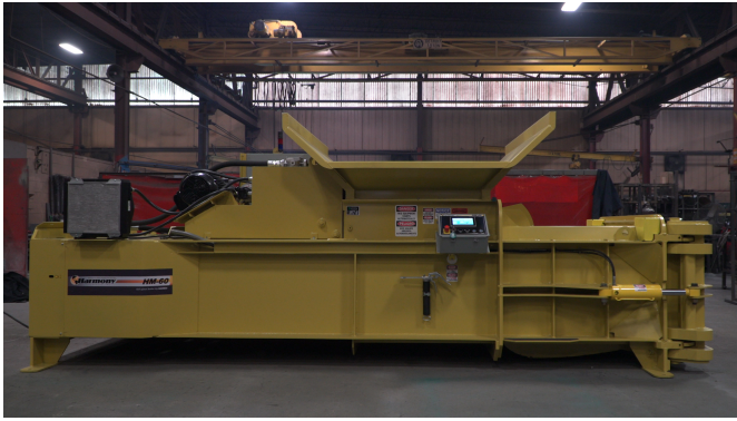
HM-60 Horizontal Baler