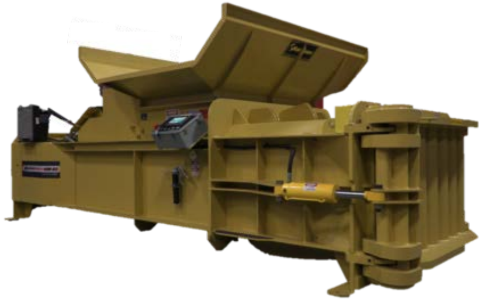
Shown With Ambidextrous Hopper