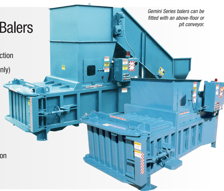
Gemini Series balers can be fitted with an above-floor or pit conveyor.