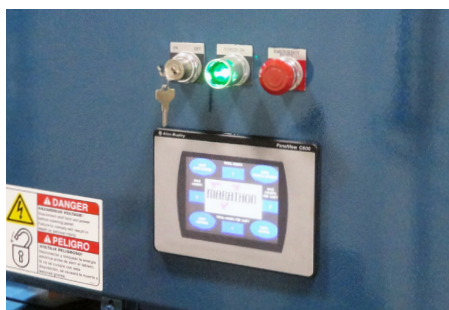
The touchscreen enables full automatic and manual control with one touch. Screens may be customized, password protected, and are designed with alarm, diagnostic, and help screens.