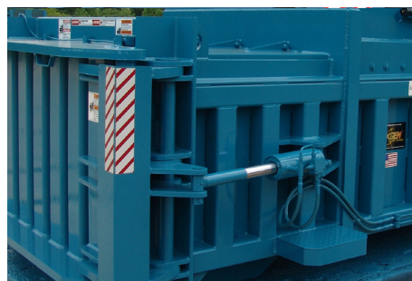
Marathon's Gemini Series balers feature a hydraulic door latch.