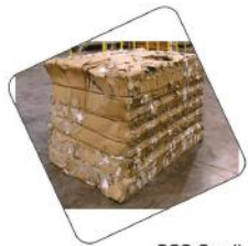
OCC Cardboard Bale