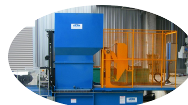
OPTION: BIN LIFTER

We reserve the right to make changes to specifications without prior notice. Bale weights are dependent upon material type.