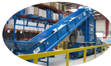
OPTION: CONVEYOR BELT