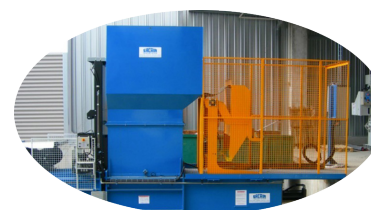
OPTION: BIN LIFTER

We reserve the right to make changes to specifications without prior notice. Bale weights are dependent upon material type.