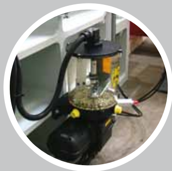
Automatic lubrication system