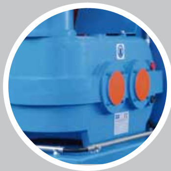
High performance gearboxes built by Forrec