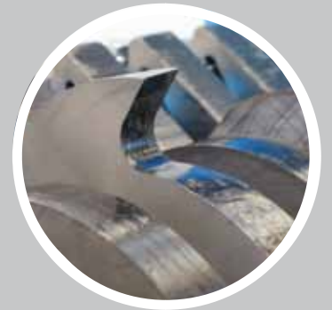
Special hot forged steel blades adjustable by thickness and number of teeth