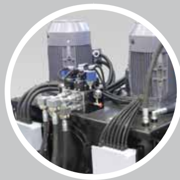
Hydraulic transmission with constant power control