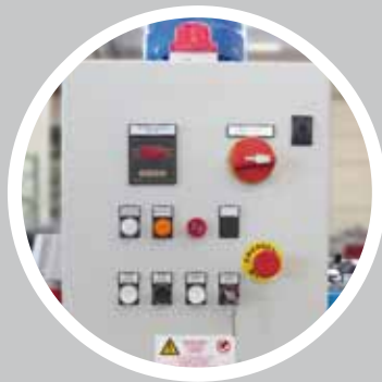
PLC to control the reverses and automation