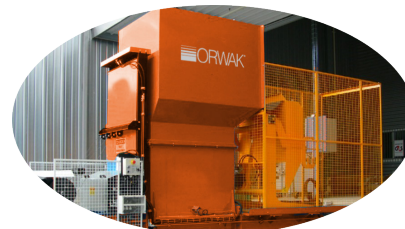
OPTION: BIN LIFTER

We reserve the right to make changes to specifications without prior notice. Bale weights are dependent upon material type.