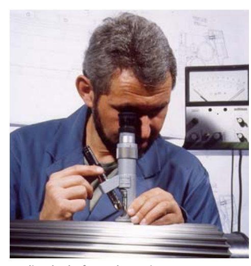
Quality check after resharpening