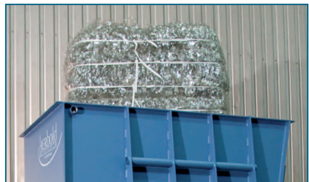
Fig. 3: Film bales