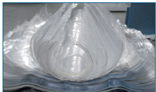
Fig. 2: Cutt open film rolls

Typical input material for the granulator of the HB series :