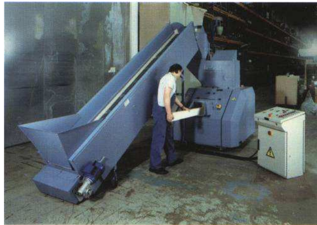
SMP 45/70 'C' with complete soundproofing and additional feed for short pieces

The Herbold granulators type SMP have specially been developed to be able to feed long pipes, plates and profiles without cutting them into sections before. The multi-knife rotor of this granulator has been designed in a way that it automatically draws in the pipes and profiles after having entered them into the feed channel.