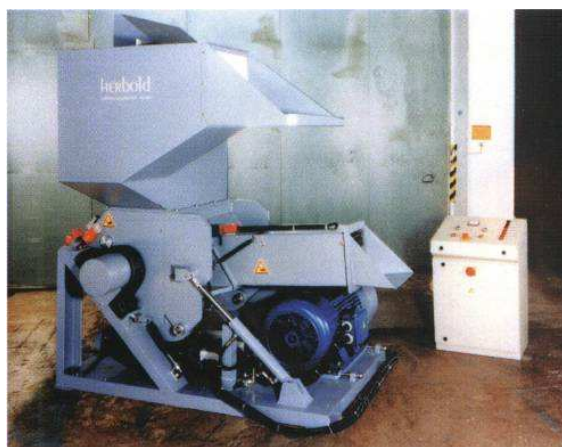
SMP 45/70 with horizontal feed trough and additional feed hopper, without sound proofing