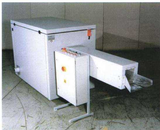
Herbold pipe granulator type SMP 22/30 EV with roller feed device and horizontal feed channel, fully sound proofed